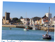
Les Sables d'Olonne

Les Sables d'Olonne is a leading seaside resort most famous for the Vendée Globe solo round the world yacht race and has a bustling promenade with a lovely 3km long sandy beach at the heart of the town. Just back from the seafloor, check out the charming "Ile de la Penotie" area, where beautiful frescoes with intricate detail made only from seashells adorn the houses.