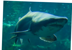
Aquarium of La Rochelle

For fun and the shortest way across the port, take the Yélo electric solar-powered sea bus to les Minimes and the very impressive Aquarium of La Rochelle , with 12,000 marine animals and 600 different species. Prepare to be mesmerised by displays of elegantly dancing sea horses, phosphorescent jellyfish and Nemo like clown fish, and thrilled by the huge shark aquarium the height of the total building.