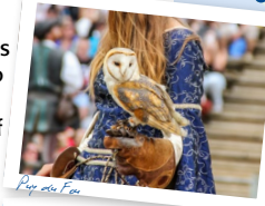
Puy du Fou

No trip to the Vendée is complete without a trip to the spectacular historical theme park of Puy du Fou , where you will need at least a day to take it all in (but could easily stretch to 2!). The park is split into up to 26 shows, most outdoors, each running for c. 30–40 minutes. And what an experience it is - a history trip back in time with animals and live actors and lots of special effects! Our must-not-miss shows include: the Vikings, the Dance of the Phantom Birds, Richelieu's Musketeer and the most spectacular gladiators and chariots in the Roman amphitheatre in the Sign of Triumph - visit to discover your own family favourites!