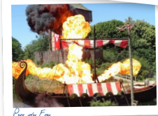
Puy du Fou

After Puy du Fou , head to Nantes , where a visit to the Les Machines de l'Île on the "isle" of Nantes bordered by the Loire river is a must. Situated in the old industrial buildings of the former shipyards, the Machines are an ambitious artistic project designed to be a blend of the invented worlds of Jules Verne and the mechanical universe of Leonardo da Vinci. You can visit the Gallery of the Machines, but best of all for us is a ride (c. 30 mins) in the 12m high Grand Elephant,