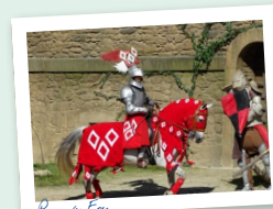
Puy du Fou